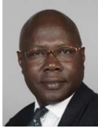
2) incorrect: shoulders askew