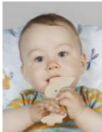
6) incorrect: toy, pillow visible