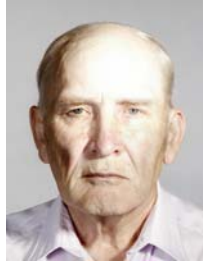
2) incorrect: hot spot on the forehead