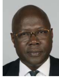
4) incorrect: head tilted