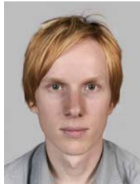
5) incorrect: optical distortion