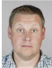
3) incorrect: raised eyebrows