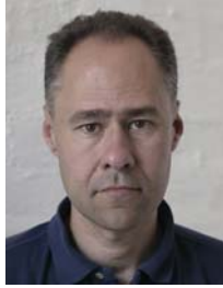
2) incorrect: uneven background