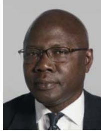
3) incorrect: head sideways