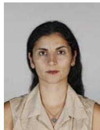
4) incorrect: too far