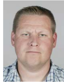
4) incorrect: squinting