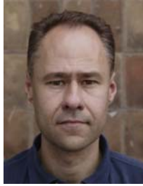
3) incorrect: busy background