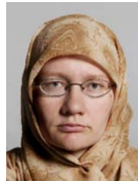
7) incorrect: shadows across face