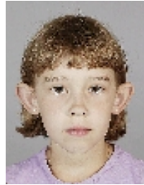
3) incorrect: pixelated