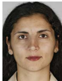
5) incorrect: too close