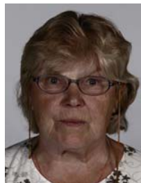
6) incorrect: underexposed