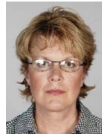
9) incorrect: reflections on glasses