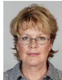
8) incorrect: frames covering eyes