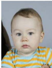
7) incorrect: shows another person