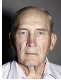
3) incorrect: directional light, shadow