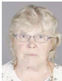
5) incorrect: overexposed