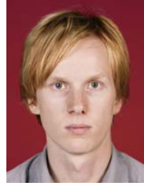
4) incorrect: dark background