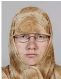
6) incorrect: forehead covered